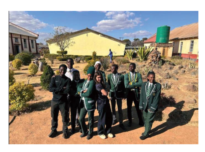
Boarding life. Thekwane High School